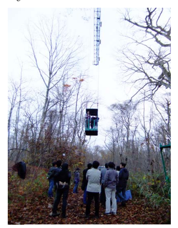
Figure 3. Approaching tree canopies using canopy crane (Ex.A)