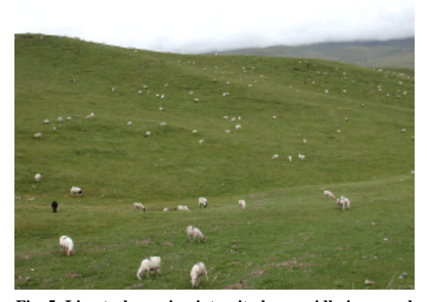
Fig. 5 Livestock grazing intensity has rapidly increased on the Qinghai-Tibetan plateau during last decades.

High UV-radiation on the plateau could be another important factor affecting photosynthetic CO<sub>2</sub> uptake. By artificially increasing UV-B radiation, we examined photosynthetic CO<sub>2</sub> uptake for different alpine species from the Kobresia meadow (Shi et al. 2003). We found that neither photosynthetic CO<sub>2</sub> uptake rate nor photo-