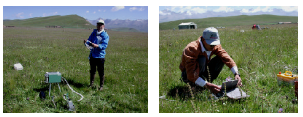
Fig. 4 Measurement of photosynthetic CO<sub>2</sub> uptake (Left) and chlorophyll fluorescence response (right) of alpine plants under high radiation