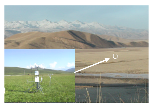
Fig. 2 CO<sub>2</sub> flux observation site in winter and in summer season (inner figure). White circle indicates the position of CO<sub>2</sub> flux tower.