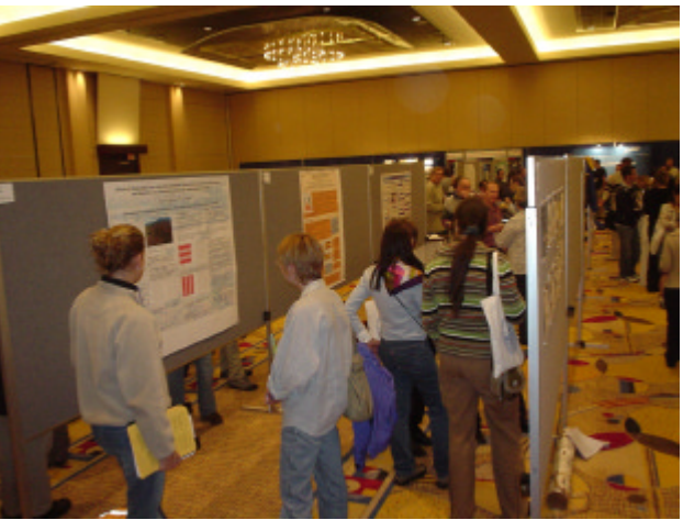
Poster session of the 26th Conference on Agriculture and Forest Meteorology.

Takayama is influenced mainly by the photosynthetic or gross primary productivity (GPP) than by ecosystem respiration (sum of autotrophic and heterotrophic respirations). This conclusion is consistent with the simulation results obtained by BEPS (Boreal Ecosystem Productivity Simulator) ecosystem model for the Takayama site (Higuchi et al.).