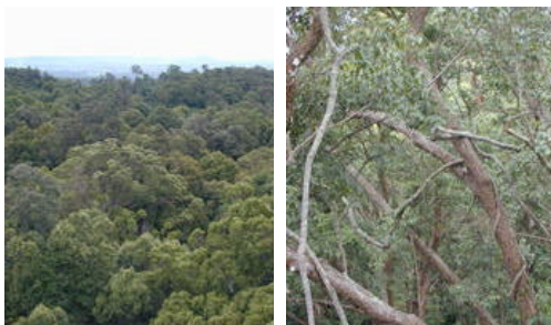
Sakaerat, Nakonrachasima, Thailand