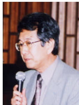
A snapshot in the FFPRI symposium

After the COP3, much discussion was conducted about the use of sinks stipulated by the Kyoto Protocol, and the COP7 held in 2001 in Marrakech, Morocco, determined how to deal with forests approved by the Protocol as carbon sinks and how to report to the UNFCCC. However, the method of measuring and assessing carbon absorption by forests that was determined at the COP7 contains many elements that cannot be addressed by conventional administrative data, and requires new scientific knowledge. The Forestry and Forest Products Research Institute (FFPRI) has exam-