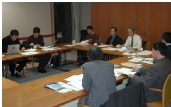
A snapshot in The 8th AsiaFlux steering committee meeting

It is accepted by the all participants that the flux measurement should be continued for a long term to evaluate the yearly average and variability of NEE. The obtained data would be a key to evaluate the global terrestrial carbon budget and to investigate the cause of the future change in environmental conditions accompanied by the climate changes. However, some groups are facing to various difficulties, such as shortage of budget, reduc-