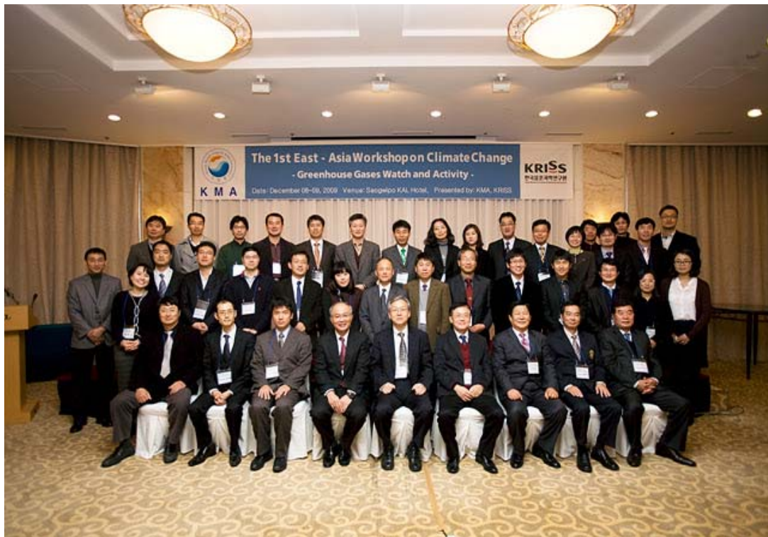
Figure 1. A group photo of the 1 st East-Asia Workshop on Climate Change.