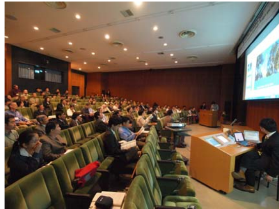
Figure 2. Oral session

Beginning by welcome addresses from the chairs of AsiaFlux and Local organizing committee, 7 representatives from regional networks in Asia (ChinaFLUX, India, JapanFlux, KoFlux, OzFlux, Taiwan, and ThaiFlux) reported their recent progresses. ThaiFlux has 4 natural forest, 3 artificial forest, and 6 agricultural field sites. They are planning to have a training course