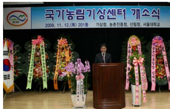
Figure 1. MoU by four institutions (left) and Inaugural ceremony for NCAM on the 12th Nov. 2009(right) at Seoul National University