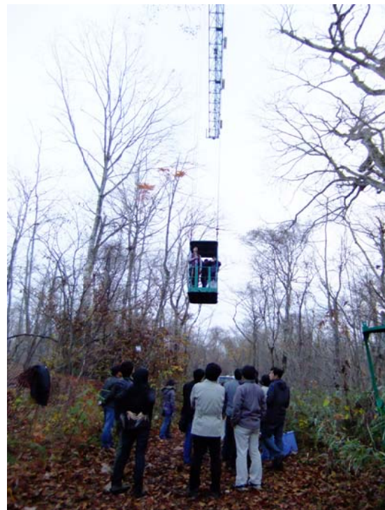
Figure 3. Approaching tree canopies using canopy crane (Ex.A)