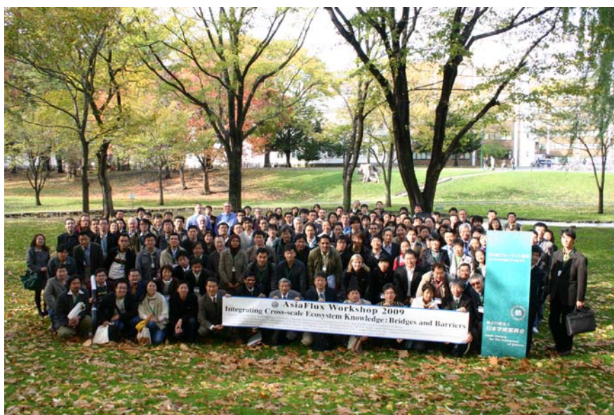
Figure 1. Memorial photo

With increasing interests in the global change issues, we are compelled to expand our views to the global biogeochemical context through collaboration with other networks of research under the framework of Earth observing system, and offer the right scientific knowledge to society to answer socio-economic questions. In this context, the workshop was organized in order to explore the advantages of collaborations between flux research community and various other research communities specializing particularly in long-term ecological research, remote-sensing, and social science to 1) deepen our knowledge about ecosystems, 2) extend our knowledge to broader regions, and 3) extend the knowledge to the society. For this purpose, we organized special sessions “Bridges between Ecosystem Observation and Remote Sensing”, “Global Biogeochemical Cycles”, and “Interfaces between Carbon Science and Society” that feature collaborations with other networks, such as iLEAPS, ILTER and Remote sensing fields. On the other hand, sessions which deal with other fluxes and ecosystem studies or technical issues