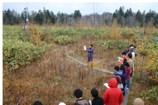
Figure 4. Young larch plantation (Ex.B)